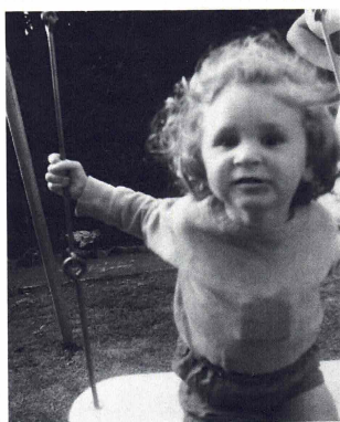
Close-up on swing –note the CalAid battery box